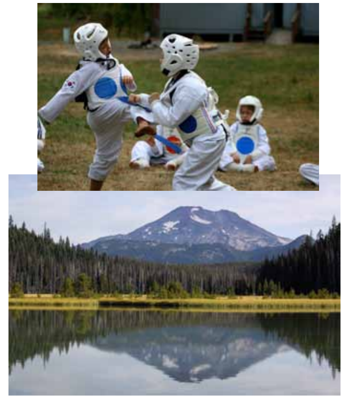
Location: Elk Lake, Oregon July 26-29, 2012