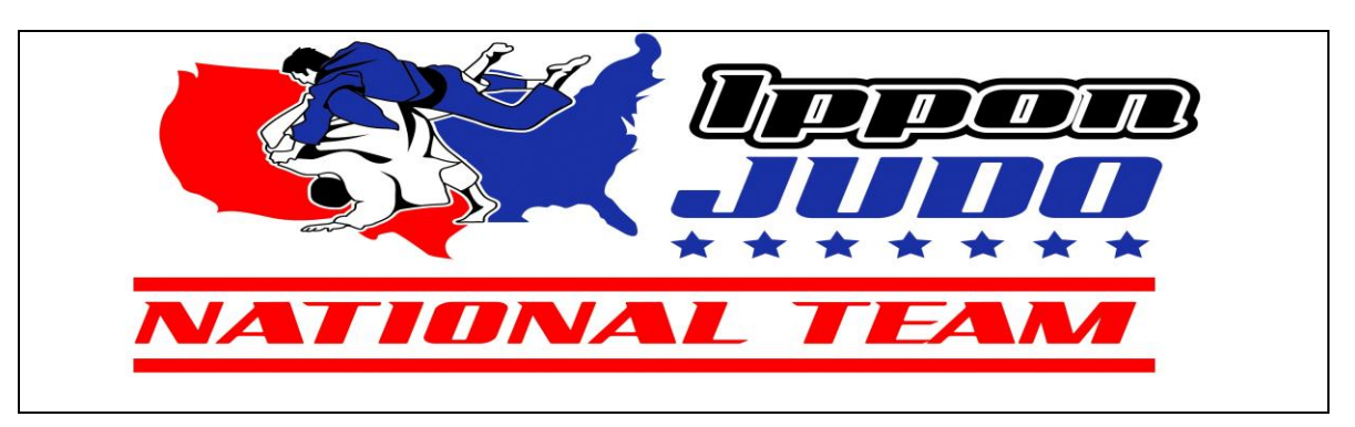
Congratulations to 2012 Olympic Bronze Medalist, Marti Malloy!!!